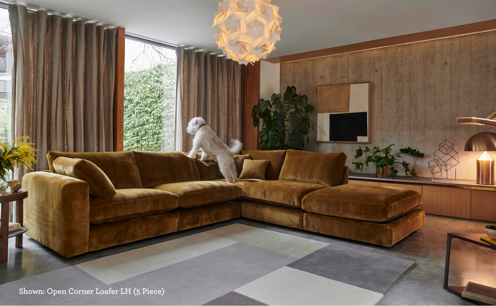
Shown: Open Corner Loafer LH (5 Piece)