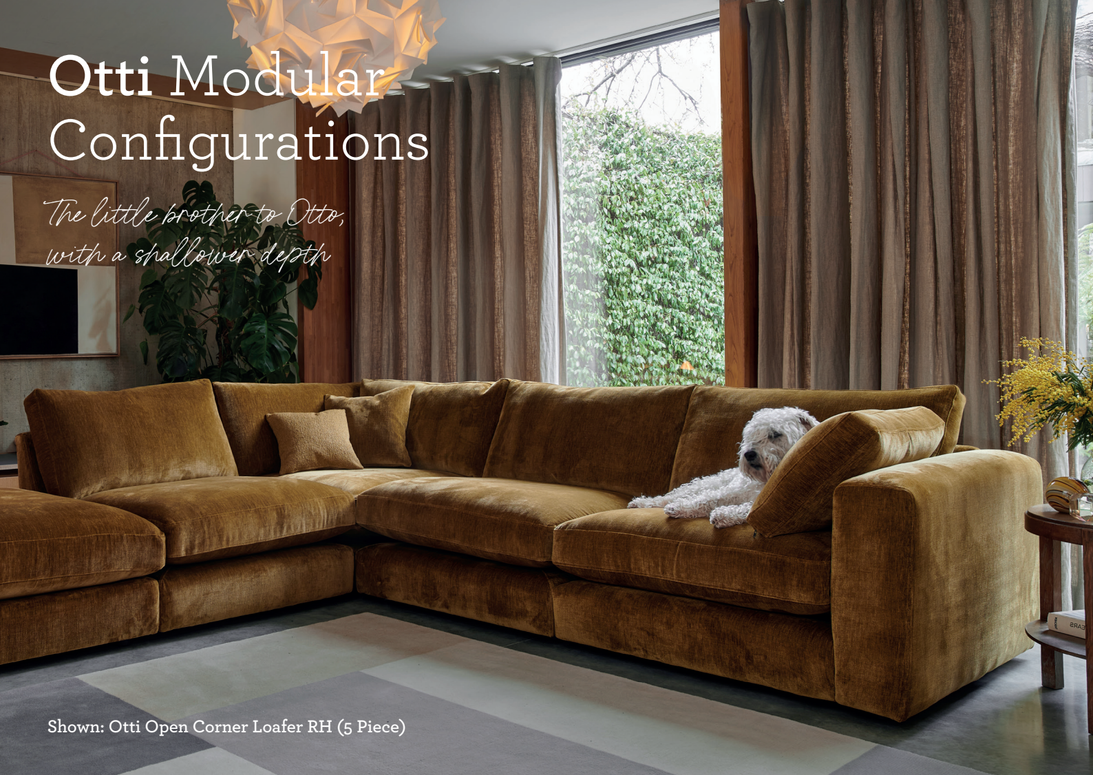
Shown: Otti Open Corner Loafer RH (5 Piece)

The little brother to Otto, with a shallower depth