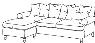
Chaise LH H80, W228, D164/113cm